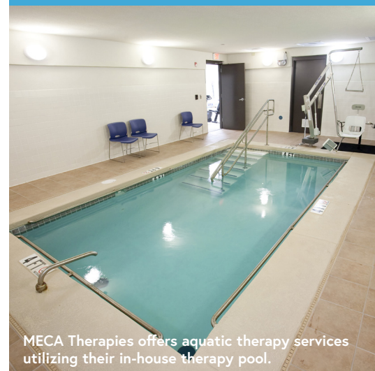
MECA Therapies offers aquatic therapy services utilizing their in-house therapy pool.