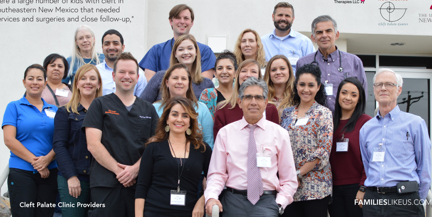
Cleft Palate Clinic Providers