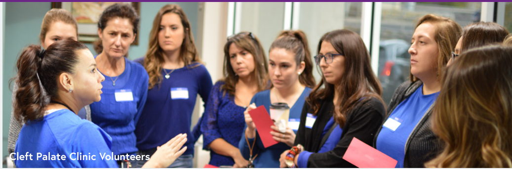
Cleft Palate Clinic Volunteers

"It seemed to me and others that there were a large number of kids with cleft in southeastern New Mexico that needed services and surgeries and close follow-up,"