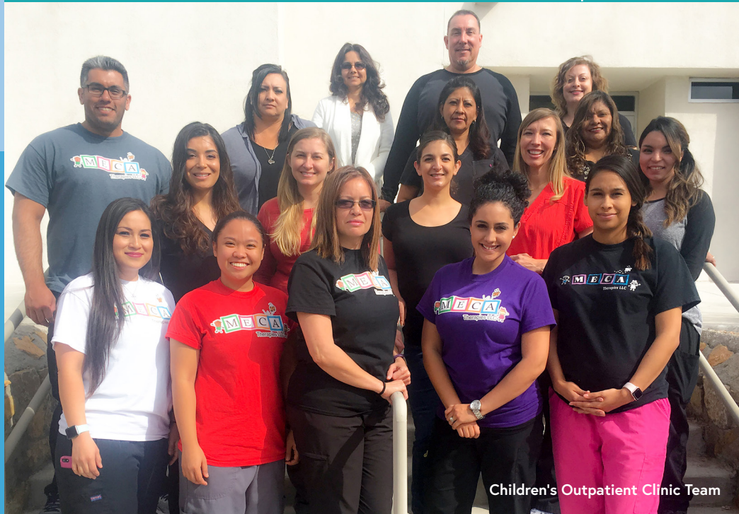
Children's Outpatient Clinic Team

Appointments must include a referral from a physician. Bilingual services are also provided.